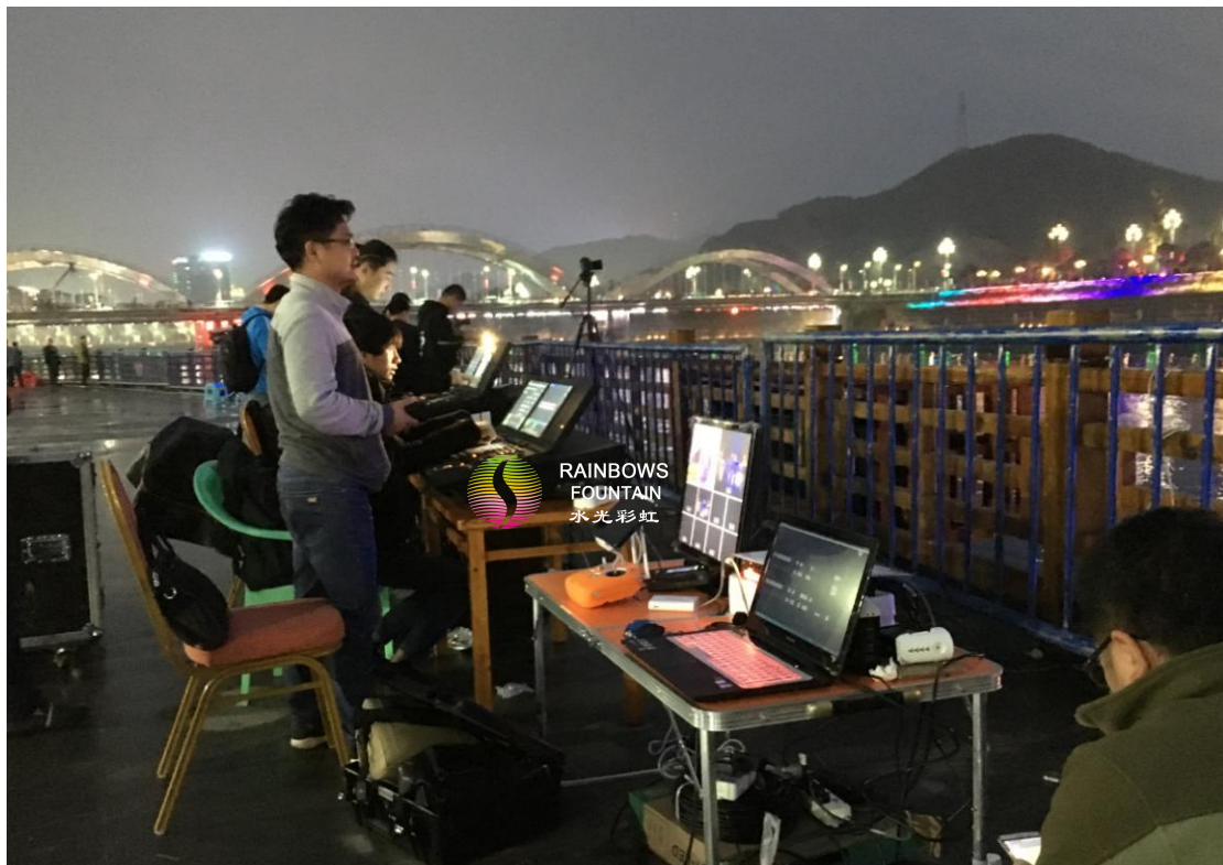
Bridge digital water curtain installation on site